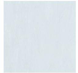
Blue Shingle 4097 w/r 4097 NCS S 1005-R90B LRV 71