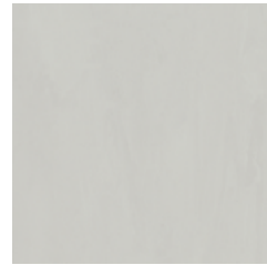
Grey Steel 4095 w/r 4095 NCS S 2500-N LRV 56