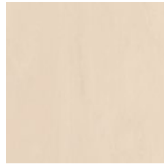
Biscuit Beige 4092 w/r 4092 NCS S 1505-Y40R LRV 62