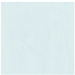
Dusted Blue 4096 w/r 4096 NCS S 0907-B20G LRV 72