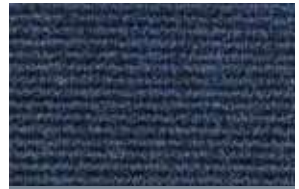
MW Rib HD Deep Blue