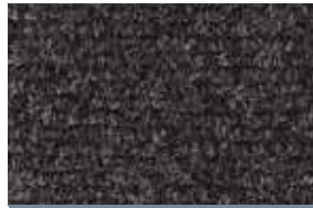
MW Rib HD Anthracite