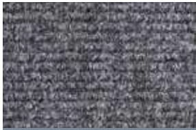
MW Rib HD Light Grey