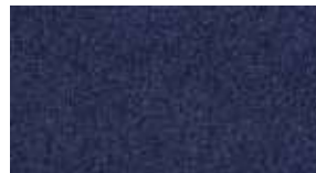
Workspace Entrance Viscount