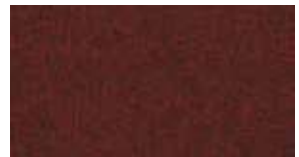
Workspace Entrance Vixen