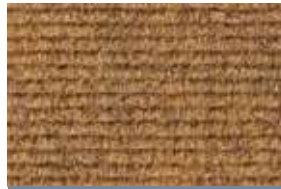
MW Rib HD Natural