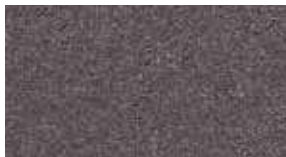
Workspace Entrance Victor