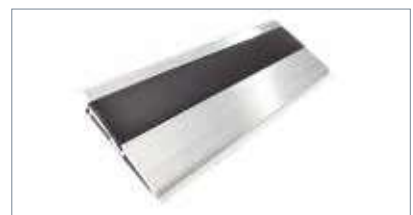
MW Ramp System