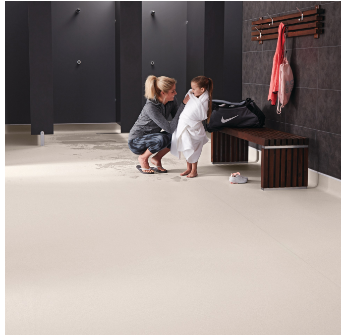
Example of a use area - Polyflor Polysafe Quattro PUR

Performance data of the product in accordance with the declaration of performance with respect to its essential characteristics according to EN 14041:2018 Resilient, textile, laminate and modular multilayer floor coverings; Essential characteristics.